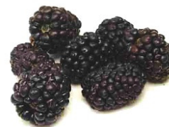
Flavors of red fruits