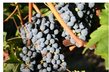
Ripe bunches of Merlot grapes