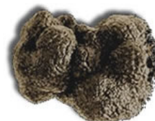
Aromas of Truffle