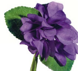
Aromas of Violette